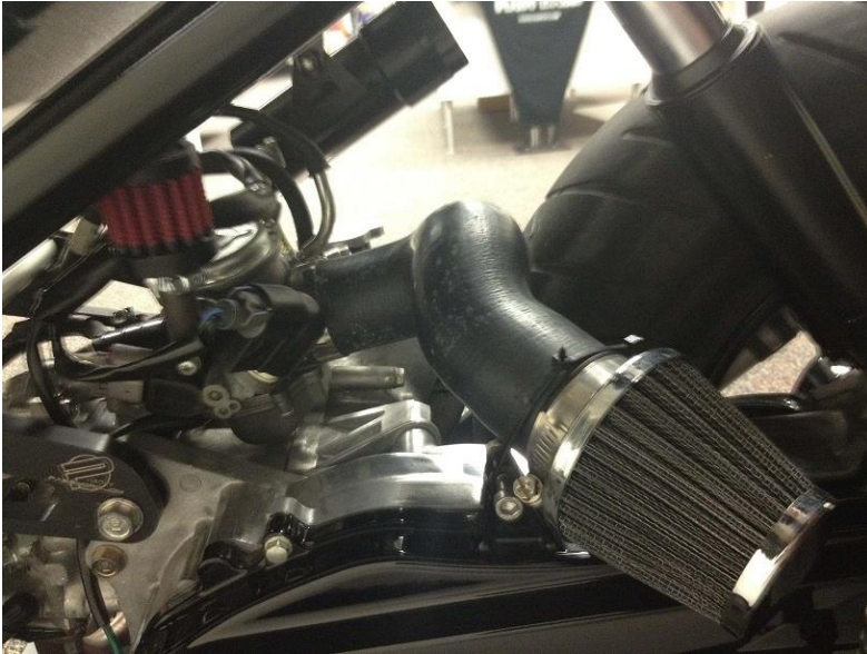
TVR INTAKE INSTALLED

Installed Type 1 (Type 2 is same just with different filter)